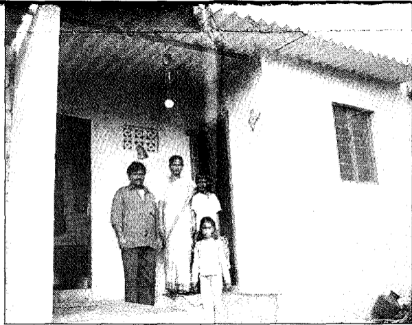
New home as part of the Village development scheme.

The goal has been to successfully obtain a 10th standard certificate for every child thereby offering them the opportunity to further their learning, whether academic or vocational. The results have far